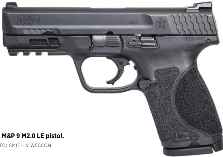
The M&P 9 M2.0 LE pistol.