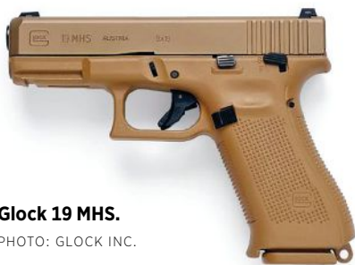
Glock 19 MHS.

Glock was also one of two finalists in the U.S. military XM17 Modular Handgun System trials to select a new joint service pistols for the U.S. Army, U.S. Air Force and U.S. Marines. The winner of the com-