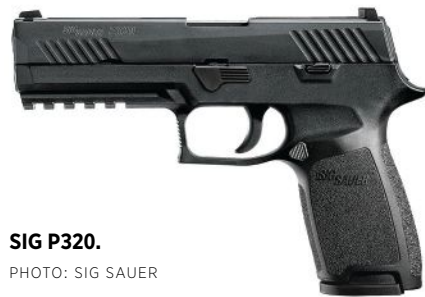
SIG P320.

pistol competition to become the new M17 joint service sidearm. Blue Line tests of the P320 demonstrated the excellent feel of the grip and very smooth trigger pull, but the high bore line resulted in more muzzle flip than a Glock. The forward centre of gravity also caused it to feel initially awkward in the hand, especially with a light attached to the forward frame rail.