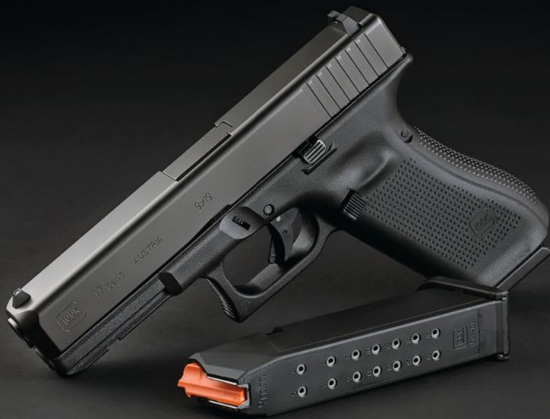
Glock Gen5.

some would arguably call the first good-looking Glock handgun. Originally designed for the FBI contract, the 17M used most of the features of Glock's Gen5 model, released in August 2017: