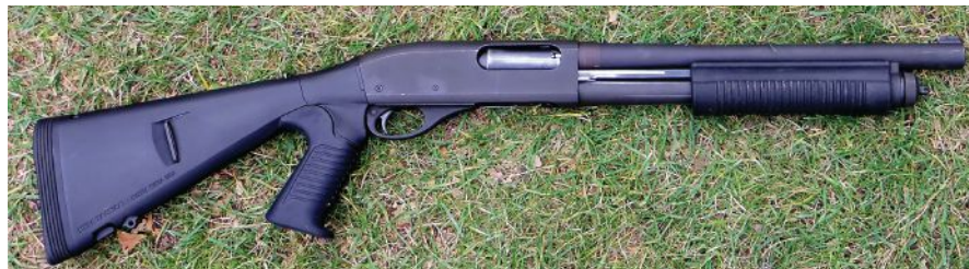
A police shotgun.

In previous Blue Line head-to-head holster tests, we found the only advantages of the Blackhawk holster to be that they were cheap and could be purchased anywhere. But most agencies found that holsters bought for cheap (and practically at your local convenience store) are not necessarily the ones that stand up to the rigours of dynamic training plus daily shift